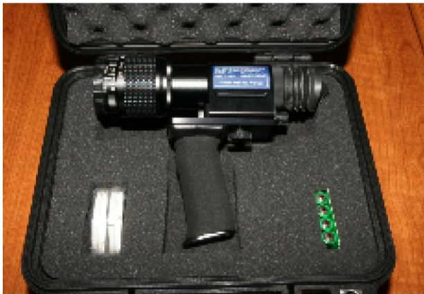
Corona Detector Camera